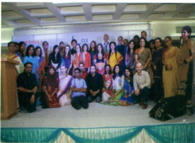
Critical Language Scholarship Program students, faculty & US Embassy officials

BLI is one of the best university affiliated language programs for teaching and learning Bangla as a Foreign Language in Bangladesh, which hosts the prestigious Critical Language Scholarship (CLS) Program, Fulbright Language Training Program, Foreign Language Area Studies (FLAS) Award, BOREN, NSF, NSEP grant, and other prestigious US Department of State awardees in addition to holding regular on campus and online classes for anyone interest in experiencing Bangladesh with BLI. The faculty members affiliated with BLI have more than 8 years of experience in teaching Bangla as a Foreign Language along with a strong academic background. Many received training in the US as a Fulbright Language Teaching Assistant and participated in international conferences on language pedagogy and linguistics. Besides providing a university level academic experience, BLI also provides an access to all the facilities offered by the university. This includes all forms of extracurricular activities, gym, and library membership.