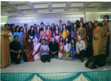
Critical Language Scholarship Program students, faculty & US Embassy officials

BLI is one of the best university affiliated language programs for teaching and learning Bangla as a Foreign Language in Bangladesh, which hosts the prestigious Critical Language Scholarship (CLS) Program, Fulbright Language Training Program, Foreign Language Area Studies (FLAS) Award, BOREN, NSF, NSEP grant, and other prestigious US Department of State awardees in addition to holding regular on campus and online classes for anyone interest in experiencing Bangladesh with BLI. The faculty members affiliated with BLI have more than 8 years of experience in teaching Bangla as a Foreign Language along with a strong academic background. Many received training in the US as a Fulbright Language Teaching Assistant and participated in international conferences on language pedagogy and linguistics. Besides providing a university level academic experience, BLI also provides an access to all the facilities offered by the university. This includes all forms of extracurricular activities, gym, and library membership.