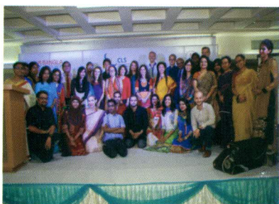
Critical Language Scholarship Program students, faculty & US Embassy officials

BLI is one of the best university affiliated language programs for teaching and learning Bangla as a Foreign Language in Bangladesh, which hosts the prestigious Critical Language Scholarship (CLS) Program, Fulbright Language Training Program, Foreign Language Area Studies (FLAS) Award, BOREN, NSF, NSEP grant, and other prestigious US Department of State awardees in addition to holding regular on campus and online classes for anyone interest in experiencing Bangladesh with BLI. The faculty members affiliated with BLI have more than 8 years of experience in teaching Bangla as a Foreign Language along with a strong academic background. Many received training in the US as a Fulbright Language Teaching Assistant and participated in international conferences on language pedagogy and linguistics. Besides providing a university level academic experience, BLI also provides an access to all the facilities offered by the university. This includes all forms of extracurricular activities, gym, and library membership.