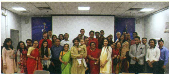
BLI faculty & students holding the International Mother Language Day celebration at the American Center, US Embassy, Dhaka