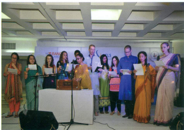
American students of BLI performing at the talent show

Besides studying Bangla, students can enroll for different extracurricular activities like singing, dancing, sports, craft, and cooking to have an insight into the Bangladeshi culture.